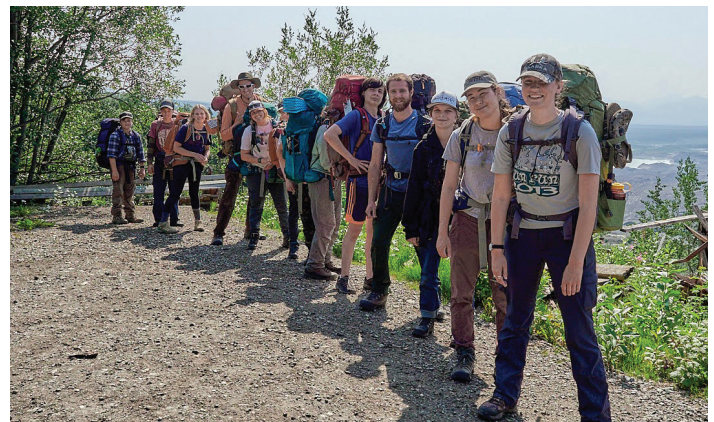
▲ Wrangell Institute of Science and Environment's Geology Camp ▼