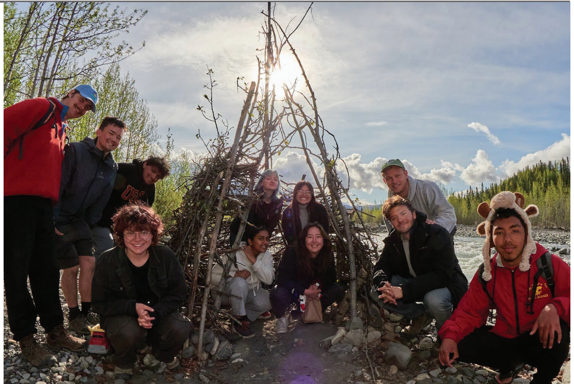
▲ University of Southern California students by McCarthy Creek