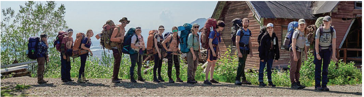
▲ Wrangell Institute of Science and Environment's Geology Camp